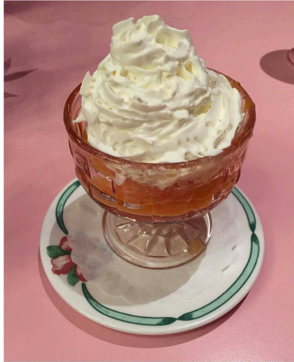
THE GREENBRIER, WV