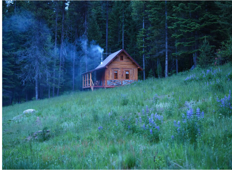
MINAM RIVER LODGE, OR