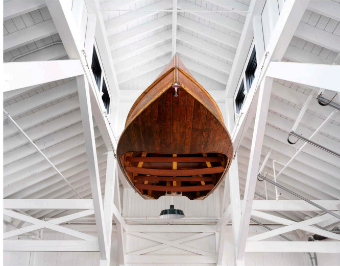
THE LAKE HOUSE ON CANANDAIGUA, NY