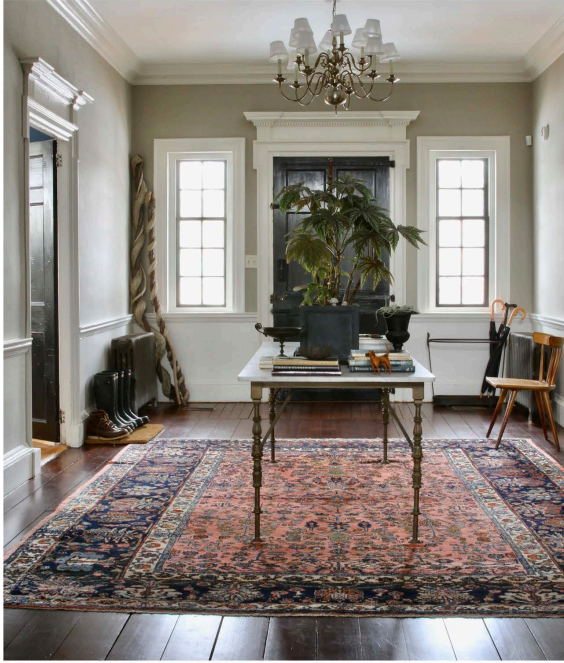
THE INN AT KENMORE HALL, MA