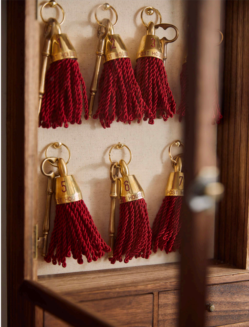
POST HOUSE, SC