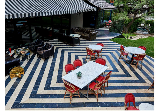
HOTEL SAINT CECILIA, TX

“When you’re a touring comedian, your hotel is your home away from home. And when you return to various cities over the years, certain hotels tend to hold a special place in your heart. For me, the St Cecilia in Austin is always a treat. From grabbing a few records from the lobby at check-in, coming home to the glowing SOUL sign over the pool, and the singular decor that feels cool yet comfortable/weird—it’s exactly what you want in your temporary home on the road”—Aziz Ansari