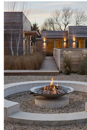
SHOU SUGI BAN HOUSE, NY