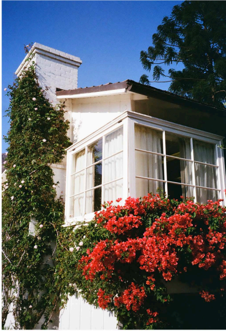
SAN YSIDRO RANCH, CA

“Arriving on a weekend to personalized stationary in your rustic cottage, a blood orange margarita in the garden and a dinner under the stars—you forget you’re only an hour and a half away from Los Angeles.”