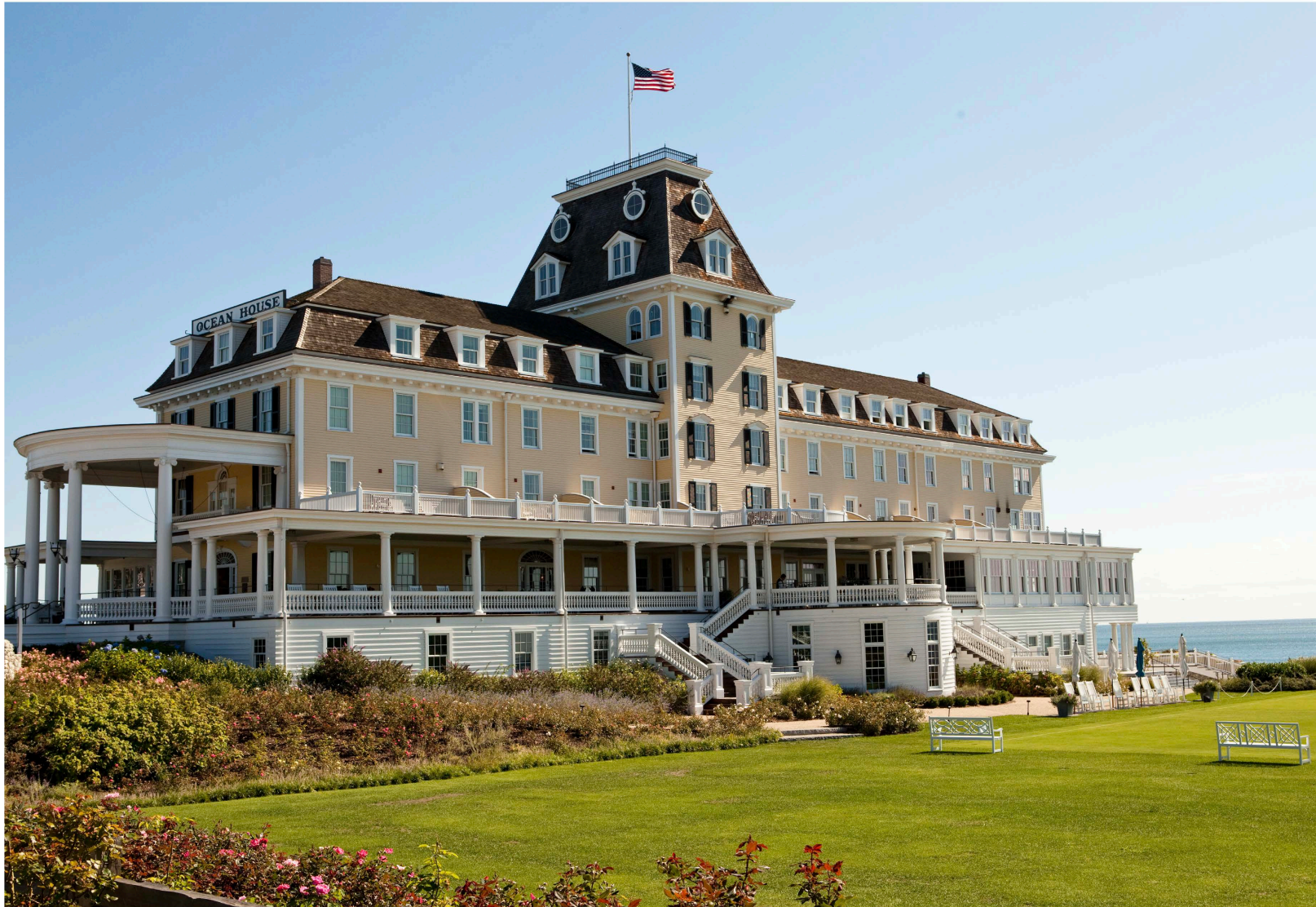
OCEAN HOUSE, RI