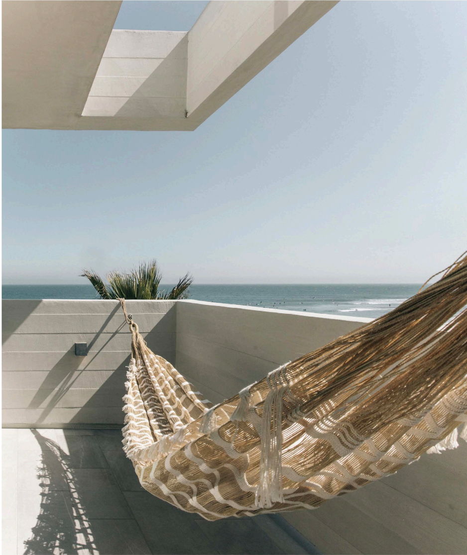
THE SURFRIDER, CA

We asked some of our most well-traveled friends to share their favorite getaways in in the States—plus a couple of city hotels that feel like stylish oases.