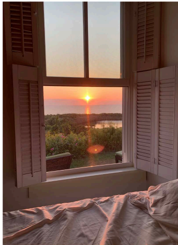
SEA BREEZE INN, RI