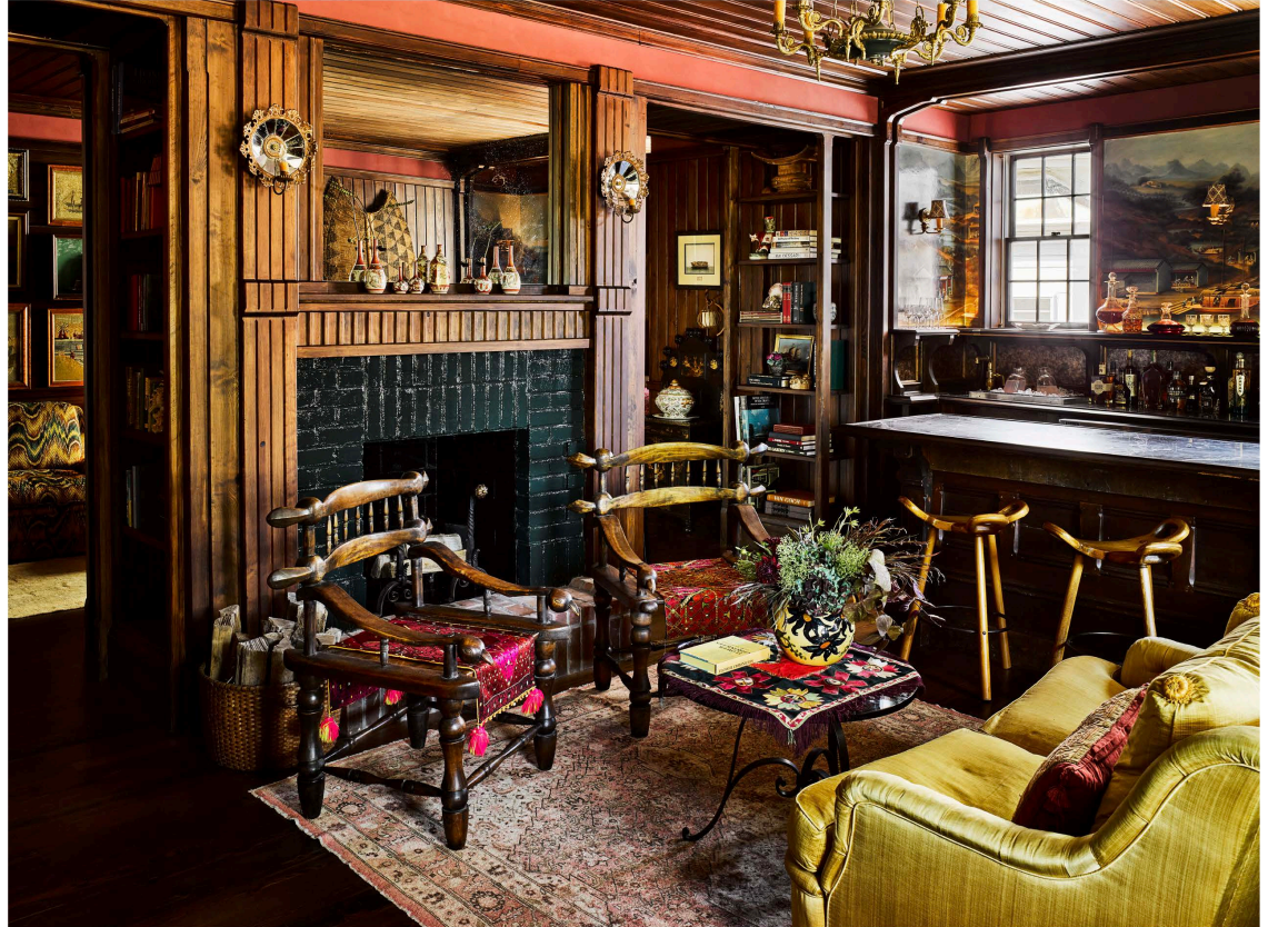
GREYDON HOUSE, MA