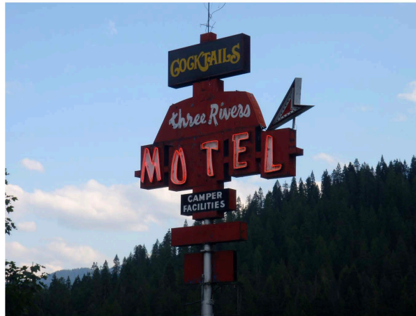
THREE RIVERS MOTEL, ID